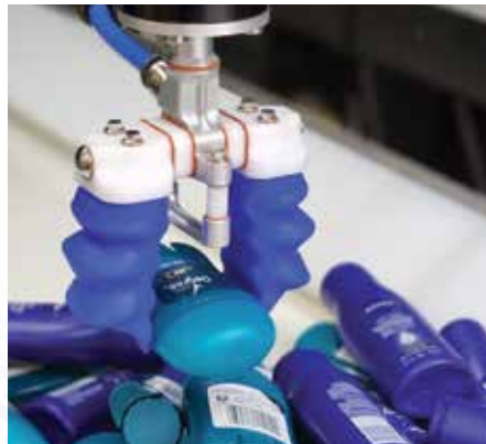
Piled on a Conveyor