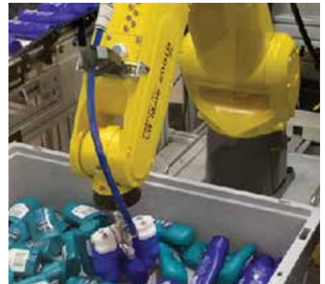
3D Bin Picking