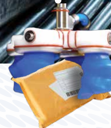
mGrip™ Soft Gripper Hands of the Solution