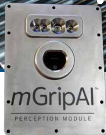
Perception Module Eyes of the Solution