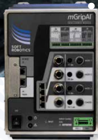
Intelligence Module Brain of the Solution